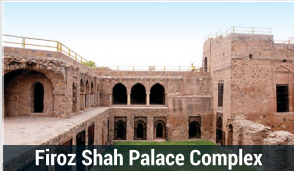
Firoz Shah Palace Complex