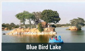
Blue Bird Lake